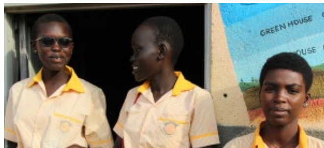
Cash Transfer recipients from City Dove Primary school in Juba, (former) Central Equatoria State